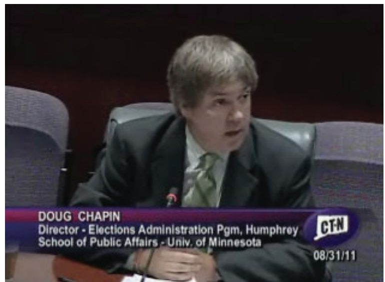
Secretary of the State Election Performance Task Force August 31st Meeting

It was agreed by all that data is lacking in the area of election costs; that centralization of the post-election audit process could achieve cost savings; and that consistency in election administration could be better achieved by the implementation of best practices and standards. Some members of the subcommittee additionally felt that the current recanvass timeframe is too short; that additional emphasis should be placed on ballot storage security; and that more financial support for Registrar training is needed.