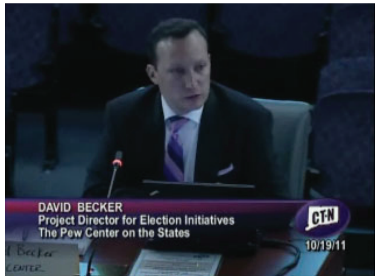
Secretary of the State Election Performance Task Force October 19th Meeting, courtesy of the Connecticut Network

One way to combat the inaccuracies of the current system is online voter registration. By having voters enter their information directly into the system, the chances for human error are reduced. It also would allow for instant tracking of voter changes of address within Connecticut so that the town of former residence would automatically have the voter removed from its rolls. Online voter registration has been implemented in several states. It can require newly registered voters to provide information in person at the polls or it can utilize a second statewide database to verify voters' identities.