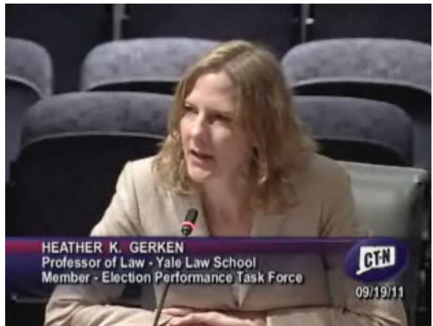
Secretary of the State Election Performance Task Force September 19th Meeting