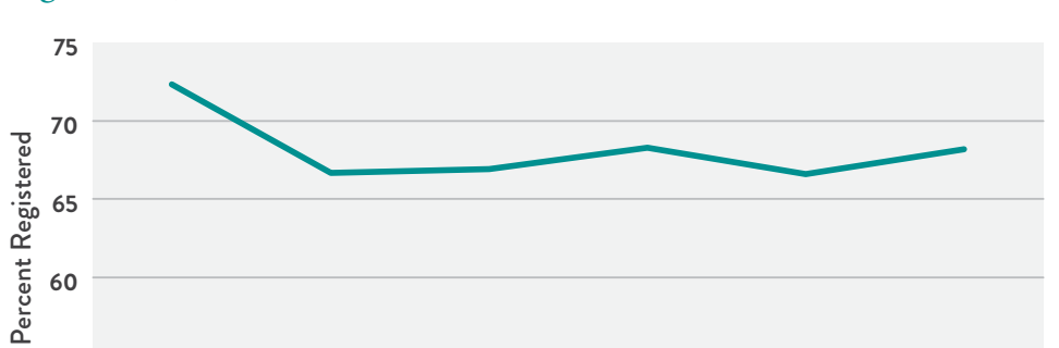
Figure 1. | OVERALL VOTER REGISTRATION RATES

Unnecessarily confusing and complicated voter registration procedures particularly impact lower-income voters. According to U.S. Census data, unregistered individuals in households making less than $15,000 are twice as likely to say they are not registered because they do not know how or where to register as those making $75,000 or more.<sup>21</sup>